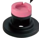
Camera di turbolenza Turbulence chamber Cámara de turbulencia